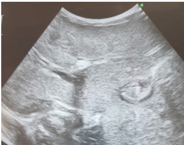
Fig. 2 An echogenic thrombus (black arrow) with a posterior acoustic shadow in the left portal vein lumen after UVC. In the proximal part of the right portal vein, the lumen is open (white arrow) with a thrombus in the lumen distally (dashed arrow), liver parenchyma is observed heterogeneously

was used in this study. Low molecular weight heparin (LMWH) is the first choice in the presence of occlusion or enlargement of affected vein detected by doppler USG and clinical symptoms. Studies on recombinant tissue plasminogen activator or urokinase therapy in complicated thrombosis have been reported. But there is few data about the benefit of thrombolytic agents use. In our clinical practice, we used LMWH, at a dose of 2 \times 100 unit/kg /per day, in selected 5 patients. The ACT treatment plan of all newborns with PVT was made by council of pediatric hematology and neonatology divisions of the institute, according to the portal vein involvement