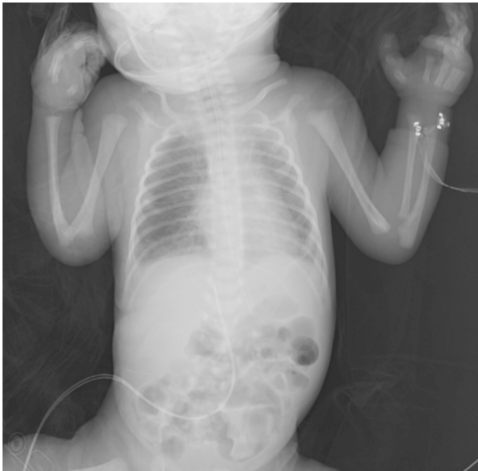
Fig. 3 A 33 gestational age new born with inserted nasogastric sandoge and UVC

affected vein and extent of thrombus within the hepatic venous circulation and the liver parenchyma involvement [25, 26]. In addition, PR/CR status and median duration of thrombosis resolution are the other significant factors in terms of better outcome achievement. In the present study, long-term complication rate was significantly higher in term babies, which was 75% in 8 term babies and 20% in 15 preterm babies, respectively. There was no significant direct effect of preterm or term delivery on the development of neonatal PVT in our study. The impact of C/S delivery on neonatal PVT is unclear. The high rate of C/S delivery in our study was due to the predominance of premature cases.